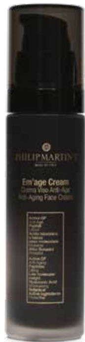
Em'age Cream Anti-Aging Face Cream