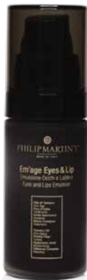
Em'age Eyes & Lip Eyes and Lips Emulsion