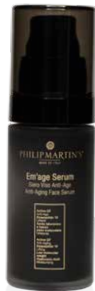
Em'age Serum Anti-Aging Face Serum

The treatment in the beauty salon, with immediate and visible results, continues at home with a precious kit containing the following products: Em'age Eyes & Lip, Em'age Serum and Em'age Cream.