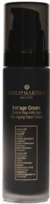
Em'age Cream Anti-Aging Face Cream