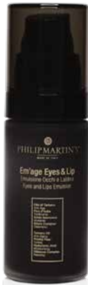
Em'age Eyes & Lip Eyes and Lips Emulsion